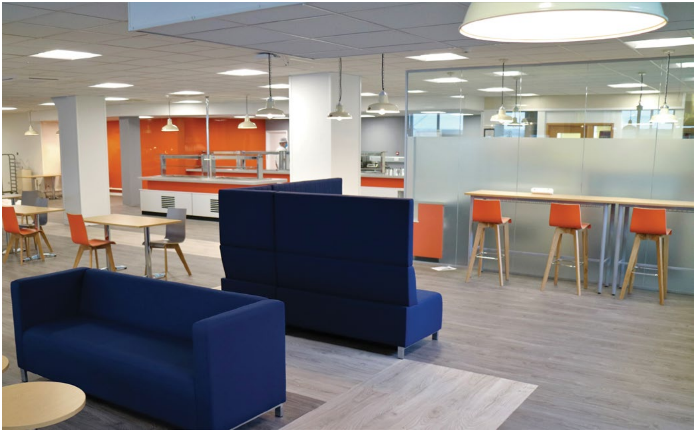
Newly refurbished Dolphin restaurant

Finally, with the maternity services moving into the BEACH in Royal Bournemouth Hospital, there is potential to convert the St Mary's site into key worker housing , improving support to new staff and staff from overseas coming to work in the local NHS. Developing this site to meet the need for housing for NHS staff is an excellent opportunity to attract and retain staff.