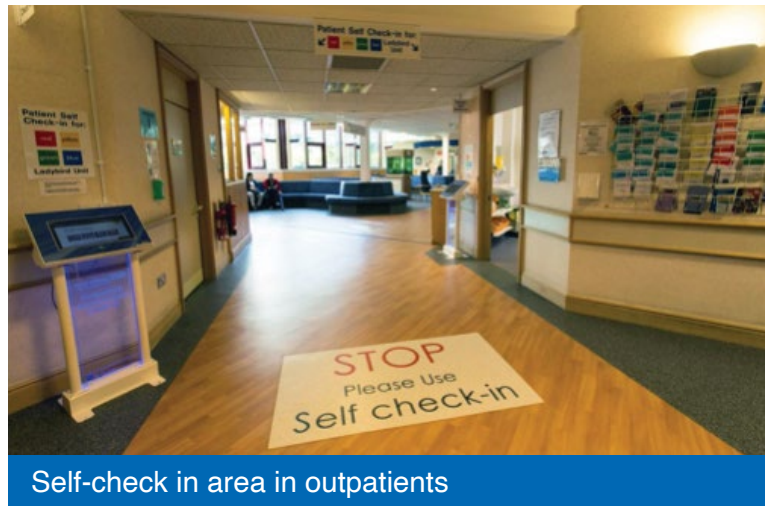
Self-check in area in outpatients

A wide range of diagnostic services, including ultrasound, MRI and CT scanning will continue to be provided from the Poole Hospital site. As booked appointments on the planned care site, there will be much less chance of these being cancelled at short notice to support peaks in emergency demand.