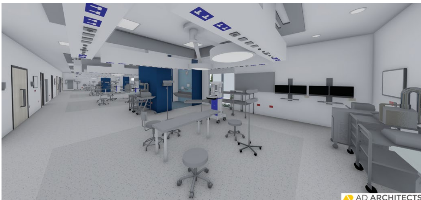
Visualisation representing the 'barn' theatre for Poole Hospital