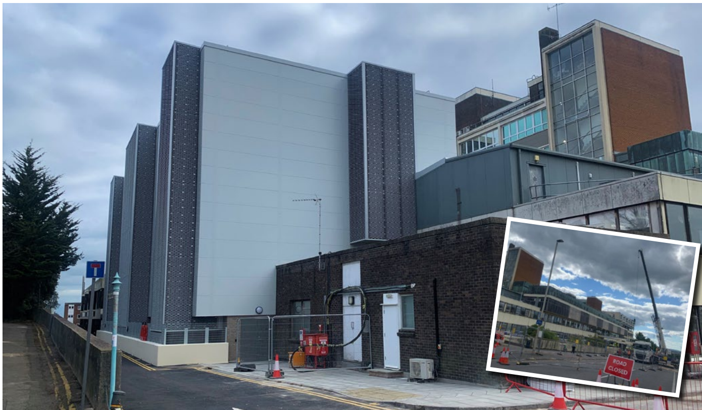
The new theatre build at Poole Hospital - view from Longfleet Road (March 2023)

The new theatre build will be an extension to the existing hospital building comprising of a brand-new purpose-built five storey tower. The development will be sympathetic to St. Mary's Church and the adjacent cemetery with the height and siting of the building from Longfleet Road having been considered to ensure that it does not block views of the church from surrounding areas.