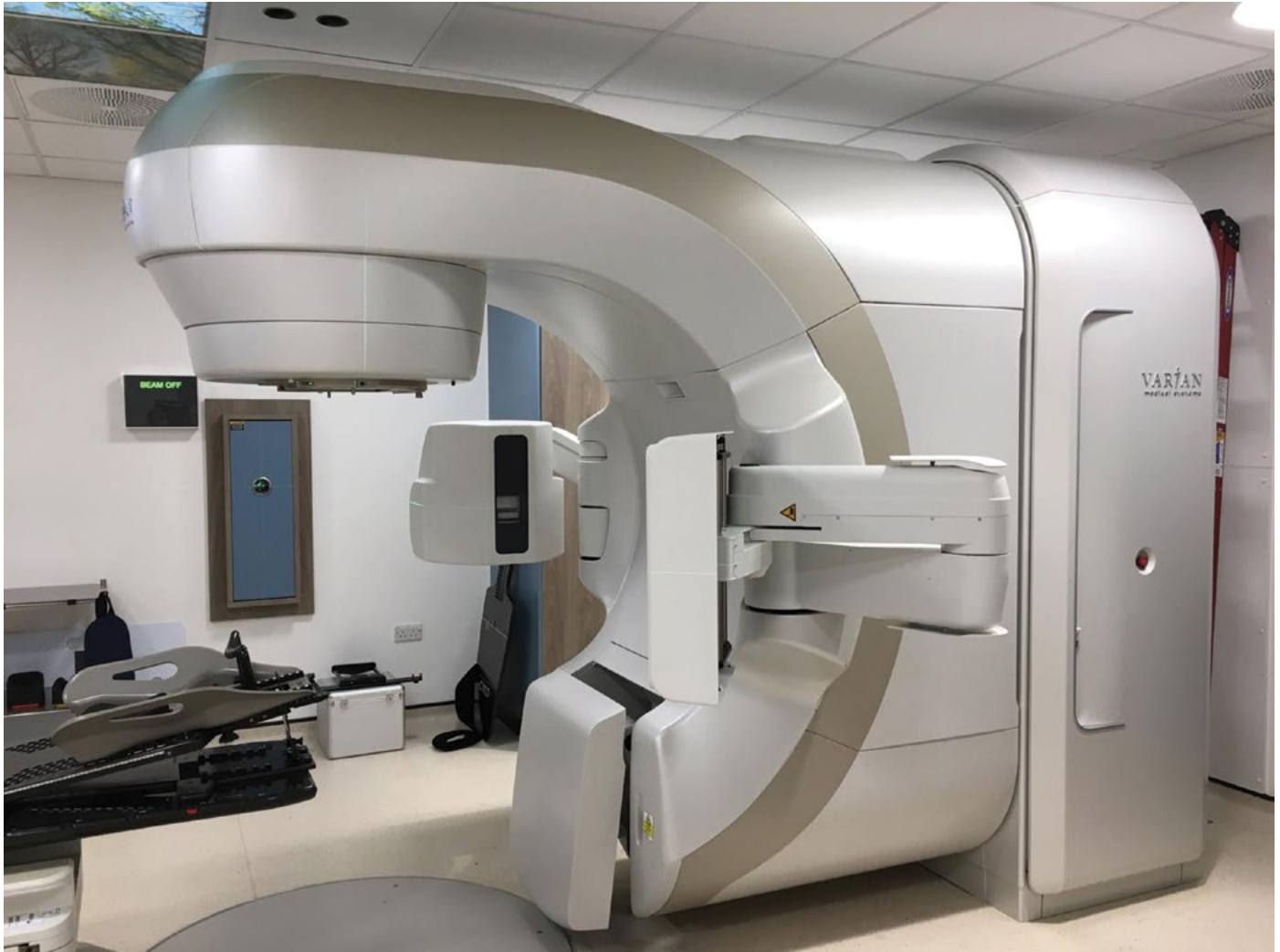
Linear accelerator in radiotherapy

The radiotherapy department is also remaining at the Poole site and Robert White Centre at Dorset County Hospital and is undergoing an equipment replacement programme of the linear accelerators used for cancer treatments. New and upgraded facilities are planned with over £4m of investment. The department will continue to be providing the full range of radiotherapy and brachytherapy planning and treatments as it does currently.