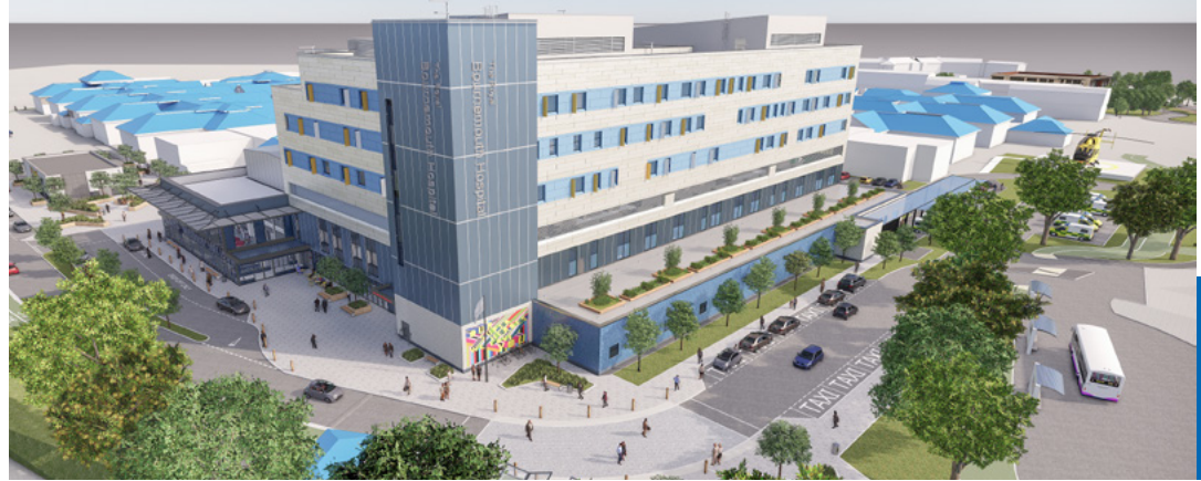
Transforming maternity, children's, emergency and critical care

The main new build extension (the BEACH) is 22,650m<sup>2</sup>. This is the equivalent to 115 tennis courts.