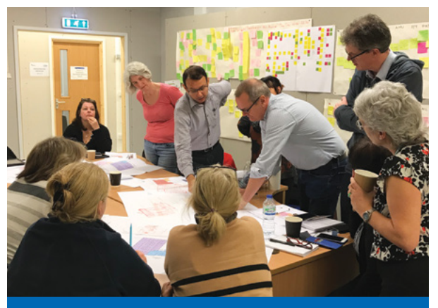
Children's services team discussing the layout of the new unit

Lessons learned from the Covid-19 Pandemic have been incorporated into the designs. This enables greater resilience and ensures the high standard of patient care can be sustained even during major incidents.