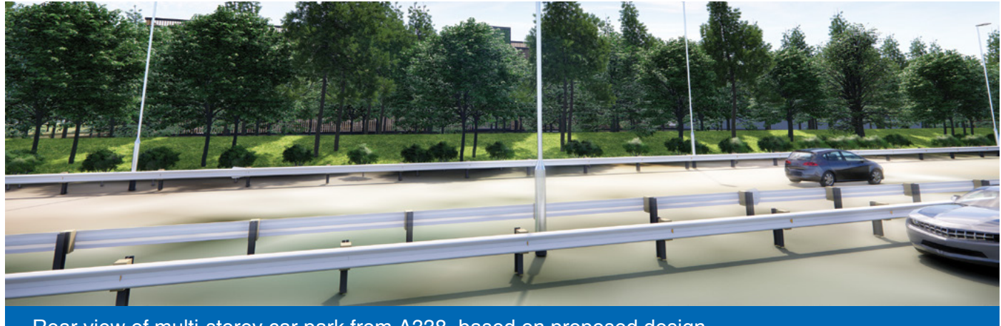
Rear view of multi-storey car park from A338, based on proposed design

In October 2022, UHD joined other NHS trusts in Dorset to launch Liftshare designed to help staff save money on their commute and reduce pollution. Liftshare is free to use and enables staff to find other NHS staff on their route, so they can share their journey.