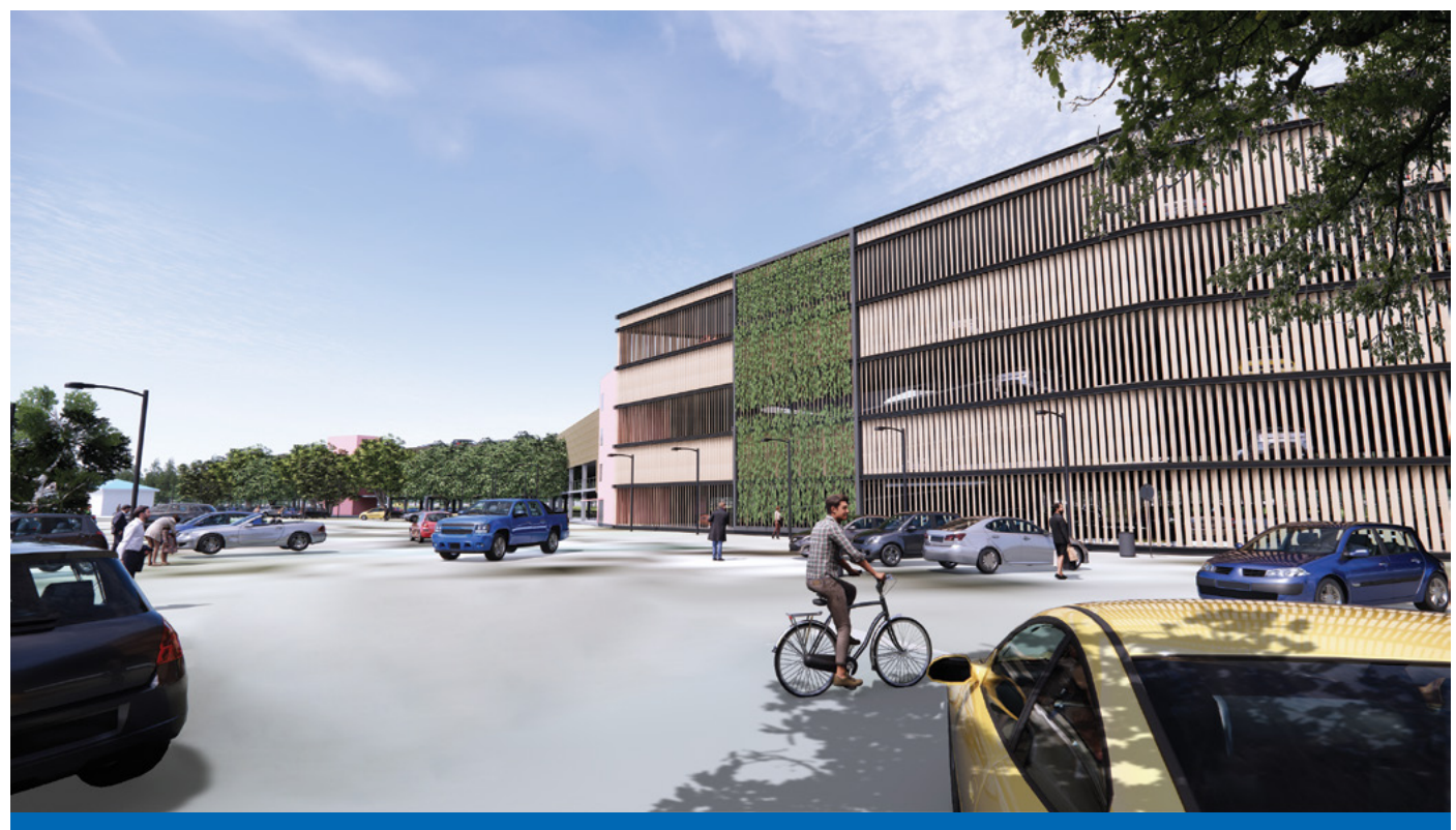
Front view of the extension to the multi-storey car park

The changes in the type of services on site, and the move of activity to community settings, Poole and Christchurch hospitals and online appointments, means the pattern of car park use will vary, with less Monday-Friday daytime patient journeys expected. Overall the same number of patient and visitor car parking spaces will be maintained as a minimum, and will be adjusted upwards if required.