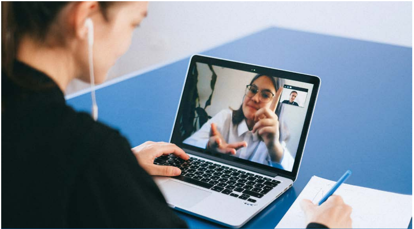
Clinicians across Dorset have led the way with virtual consultations