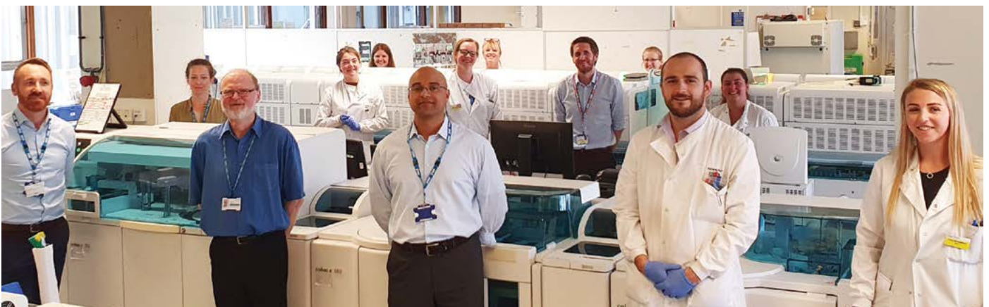
Pathology's Biochemistry team, in the frontline for diagnosis, including Covid-19 testing

The exact service road layout will be agreed with BCP Council, to future proof this with Wessex Fields, as the pathology use is mainly just delivery vehicles and disabled staff access.