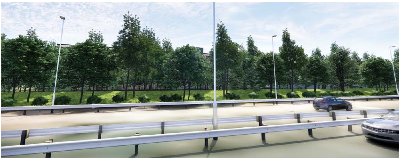
Rear view of multi-storey car park from A338, based on proposed design

The multi-storey car park extension will be higher than the existing car park, but is set further back from the A338 Wessex Way, behind a thicker tree belt. Therefore this is less visible from the road. For the detailed planning application the exact external materials and designs will be agreed to ensure an appropriate exterior.