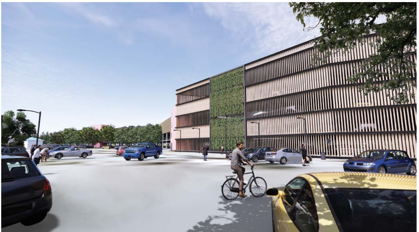
Front view of the extension to the multi-storey car park

The changes in the type of services on site, and the move of activity to community settings, Poole and Christchurch hospitals and online appointments, means the pattern of car park use will vary, with less Monday-Friday daytime patient journeys expected. Overall the same number of patient and visitor car parking spaces will be maintained as a minimum, and will be adjusted upwards if required.