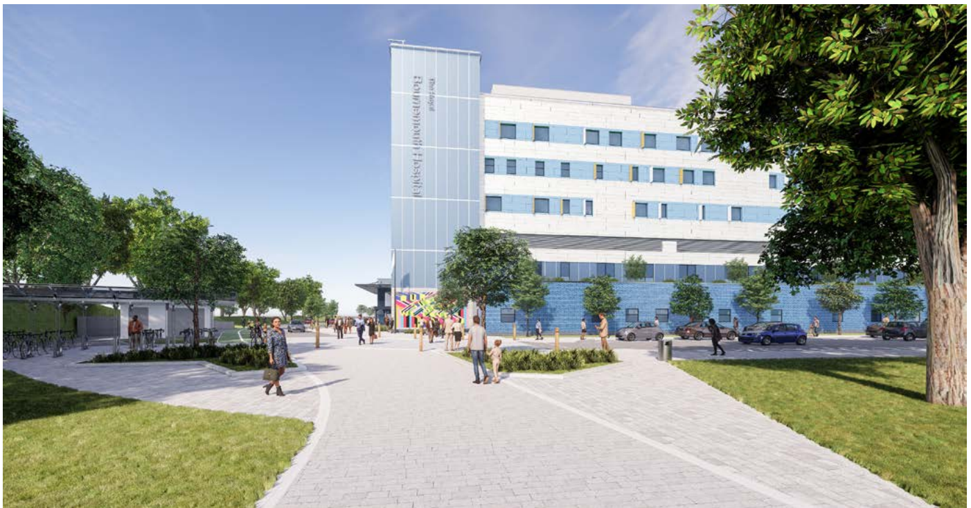
The front of the hospital will have better access to the bus hub and bike park facilities

Bus travel between sites is expected to be more reliable and quicker than driving and parking. It will also be cheaper and produce less carbon. Additionally, Wi-Fi on the bus will allow better use of time for work or leisure, than car travel.