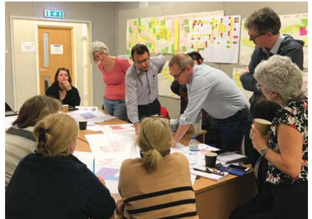
Children's services team discussing the layout of the new unit

Lessons learned from the Covid-19 Pandemic have been incorporated into the designs. This enables greater resilience and ensures the high standard of patient care can be sustained even during major incidents.