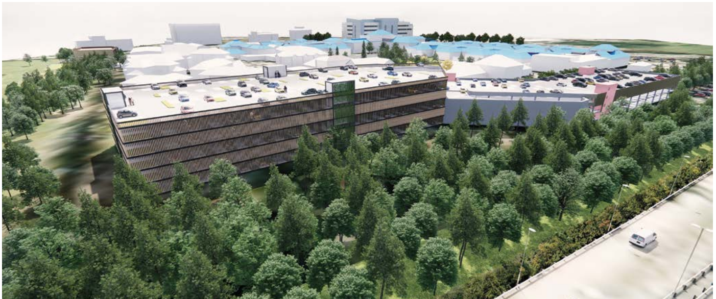
Aerial view of the multi-storey car park extension - set back behind the tree belt

This outline planning application looks to the future needs of the hospital as a whole, and the population we serve. In addition to creating a patient environment fit for the next generation, this development delivers many other far reaching benefits for the local population.