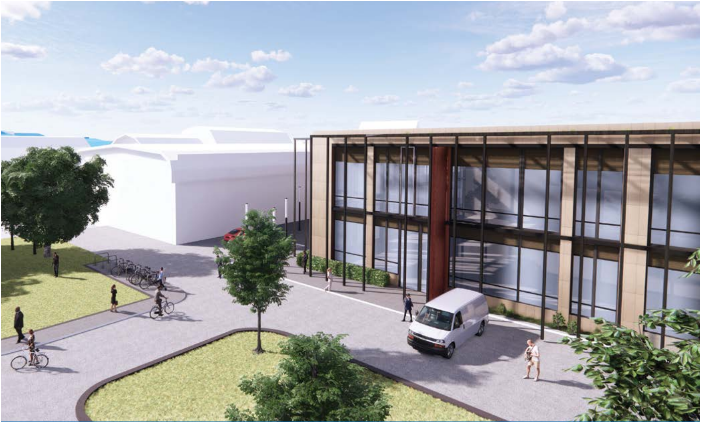
Purpose built pathology laboratory in close proximity to the hospital - also a centre for research