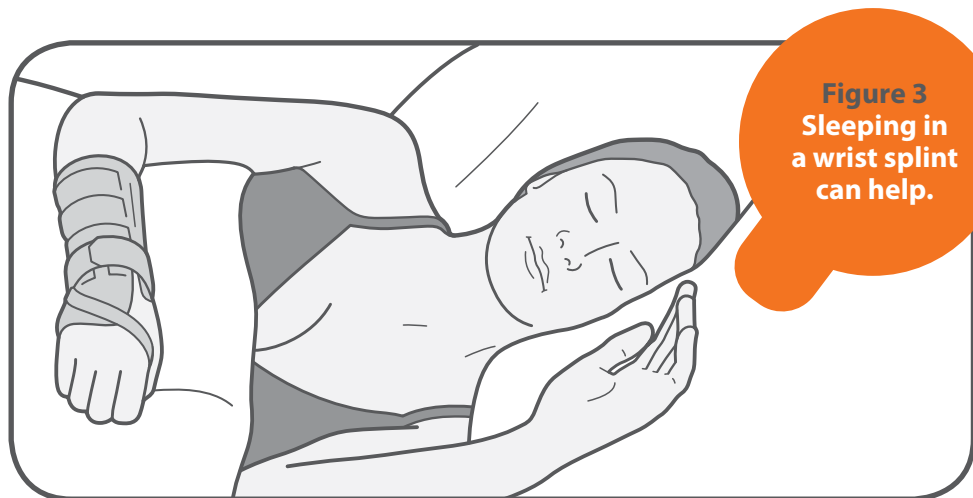
Figure 3 Sleeping in a wrist splint can help.

An occupational therapist or physiotherapist will be able to advise you about the different types of splint. Similarly, some therapists recommend certain exercises of the wrist which might help prevent the median nerve becoming stuck to nearby tendons.