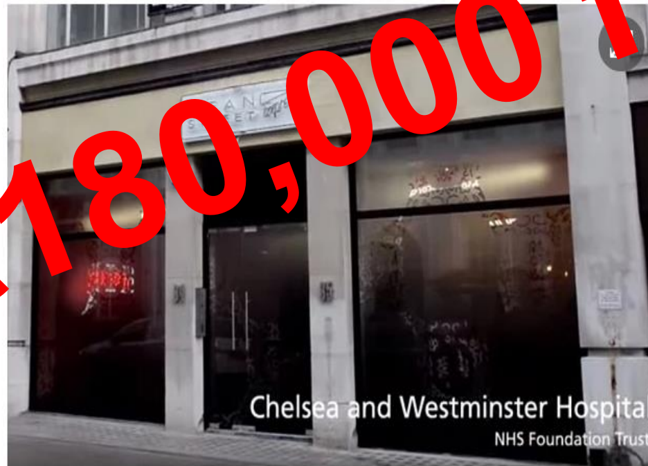
Chelsea and Westminster Hospital NHS Foundation Trust