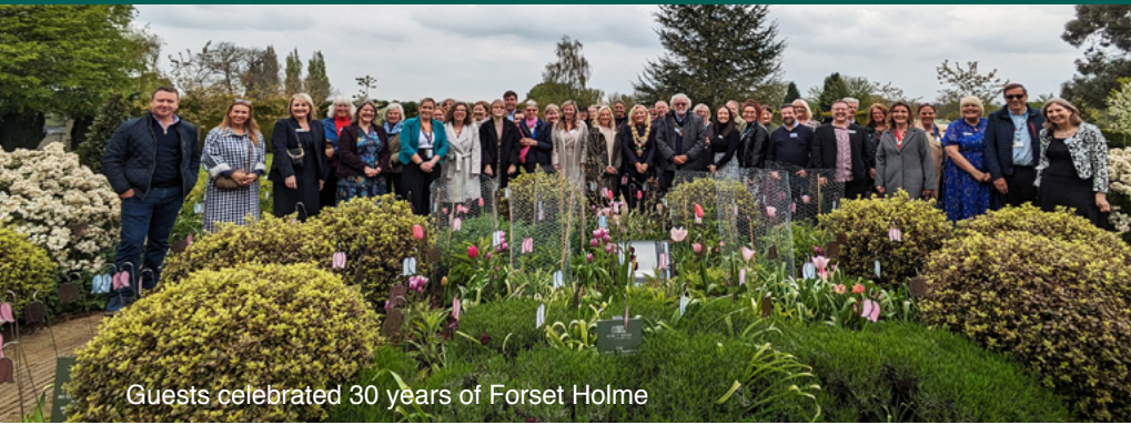
Guests celebrated 30 years of Forest Holme

30th anniversary year and is an opportunity for supporters and community members to purchase and own a special commemorative handcrafted piece of art, serving as a poignant tribute to love, loss, and compassion.”