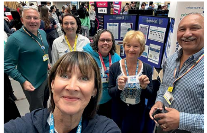
▲ A particularly memorable event was the Freshers Fair at Bournemouth University in September, where we connected with many students interested in future NHS careers