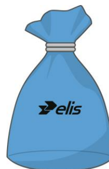
Blue Elis Bag