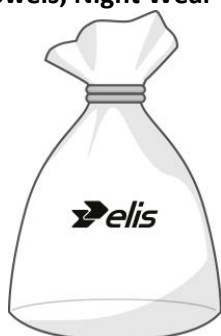
White Elis Bag

E.g. Sheets, Pillowcases, Towels, Night Wear etc