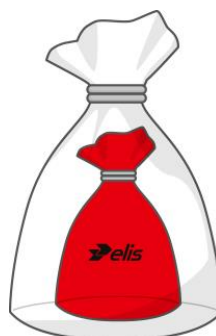
Dissolvable Red Bag Inside White Elis Bag