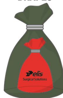
Inner Dissolvable Red Bag Outer Green Elis Reusable Bag

This supersedes all previous linen bagging policies, in adherence to Department of Health guidelines HTM 01-04