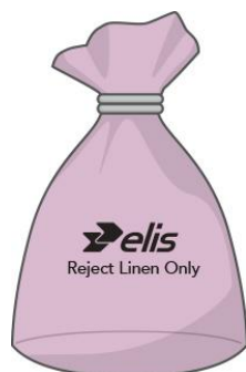
Rejected / Return Items Only Pink Elis Bag