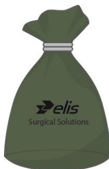
Green Elis Reusable Surgical Bag