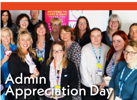
Admin Appreciation Day