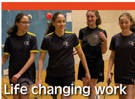
Life changing work