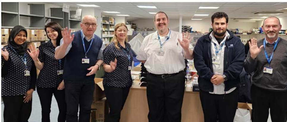
▲ Poole Medical Records Team

Please do send us pictures to communications@uhd.nhs.uk of you and your teams with the hashtag #UHDAdminProud so we can share as part of our celebration of colleagues and show your appreciation.