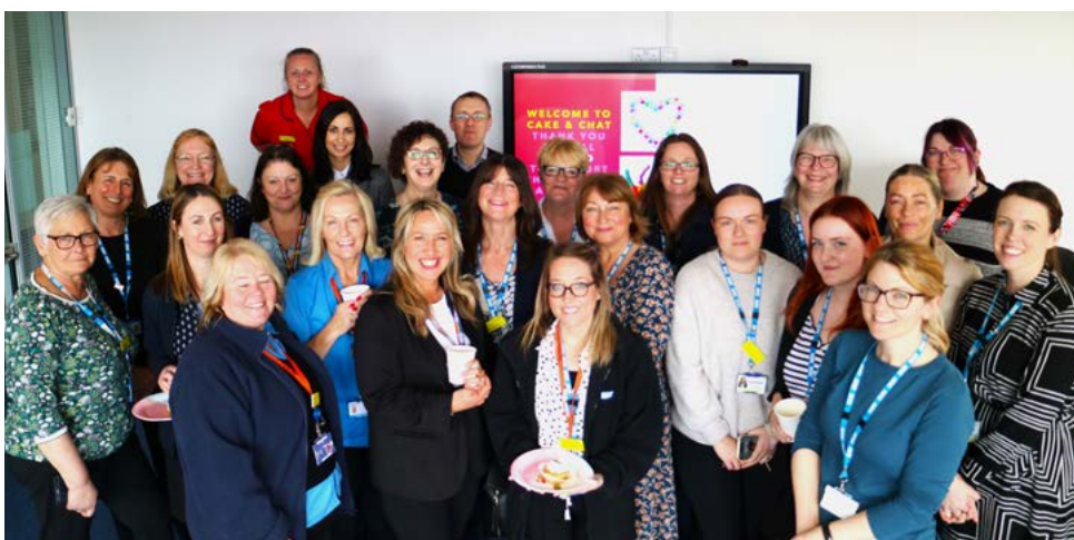
▲ Admin Day Child Health Team cake and chat