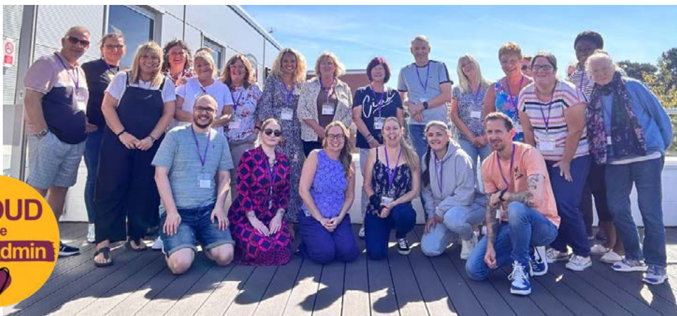
▲ Endoscopy Admin Team